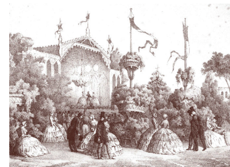
Champs-Élysées VI – Mabile, Château des Fleurs, Garden of Paris